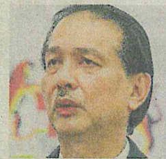
Dr Noor Hisham Abdullah

seorang peserta perhimpunan di Masjid Seri Petaling yang hadir ke mesyuarat di sebuah sekolah di Pedas. Jangkitan kemudian menular apabila ada yang menziarahi individu dijangkiti.