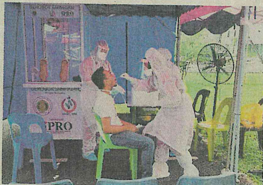
Health officials testing a student for Covid-19 at the Tawau Health Clinic in Tawau, Sabah, recently.

"The department would like to remind the public that by practising social distancing, wearing a face mask and maintaining hand hygiene, they can help contain the spread of the Covid-19 outbreak."