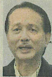
Datuk Dr Noor Hisham Abdullah

"From the 44 cases, 25 are foreigners (including 21 identified at the Semenyih Immigration depot)."